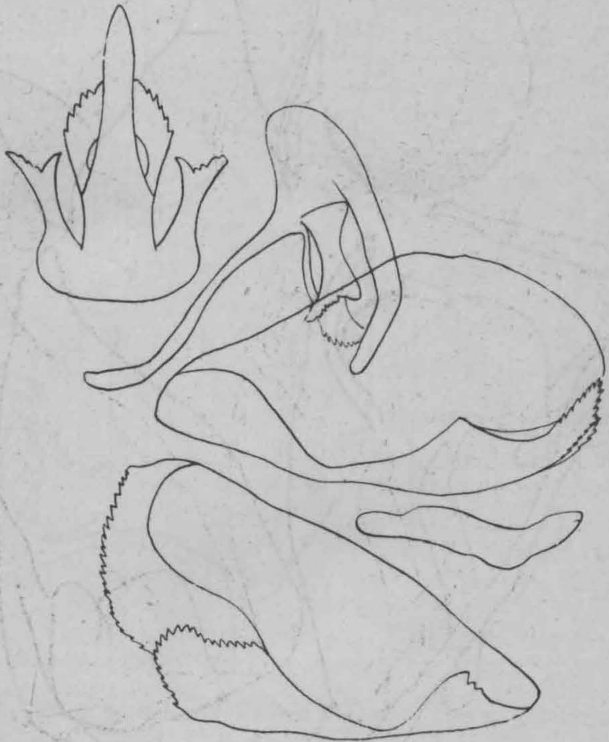
Fig. 20. —Male genitalia of Pellicia hecale Hayw. (Holotype) (With dorsal view of uncus)

Distinctly lighter on the underside than in herophile , the four transverse bands indicated on the hindwing by a series of connected roundish darker patches, those of the postmedian band lighter centrally, those of the submarginal band slightly lunate. This species is not to be separated superficially from the following species hecale .