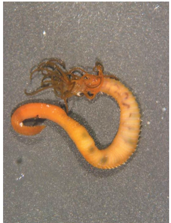
Fig. 4: Lateral view of a complete specimen of Dodecaceria cf. opulens extracted from a shell of the red abalone Haliotis rufescens from Puerto Montt, Chile.

Trozo de concha de abalón rojo Haliotis rufescens de Puerto Montt, Chile perforado por un ejemplar de Dodecaceria cf. opulens.