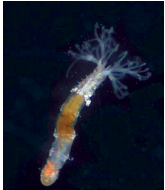
Fig. 2: Lateral view of a complete specimen of Terebrasabella heterouncinata which was extracted from a shell of the red abalone Haliotis rufescens from Puerto Montt, Chile.

Detalle de una concha de abalón rojo Haliotis rufescens de Puerto Montt, Chile en que asoman las coronas branquiales de Terebrasabella heterouncinata.