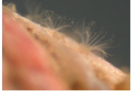
Fig. 1: Detail of the shell of a red abalone ( Haliotis rufescens ) from Puerto Montt, Chile, on which the branchial crowns of Terebrasabella heterouncinata can be observed.

Remarks: this species has been recorded living in galleries of the shells of various genera and species of marine gastropods in South Africa, including the abalone Haliotis midae , and in California there are records in the red abalone Haliotis rufescens .