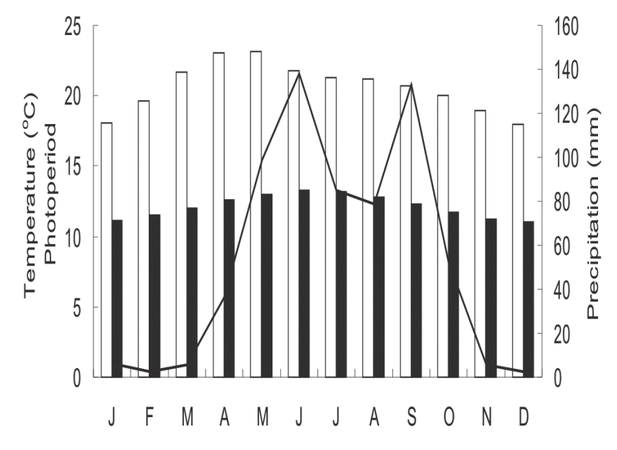
Fig. 1: Mean monthly of temperature (white bars), precipitation (line) and photoperiod (black bars) from de study area.

Promedio mensual de la temperatura (barras blancas), precipitación (línea) y el fotoperiodo (barras negras) del área de estudio.